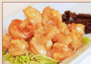
Crispy Honey Walnut Prawns