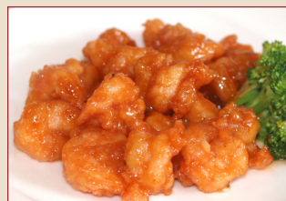
Crispy Shrimp with Sweet Chili Sauce