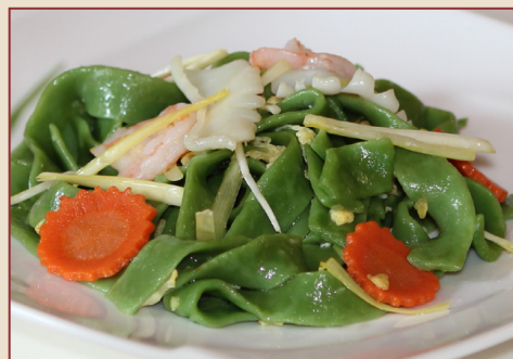
House Special Barleygreen