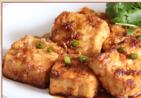
Pan Fried Bean Curd w/Chef's Special Sauce