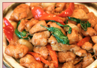
Chicken w/Garlic Ginger