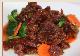
Crispy Beef Vegetables